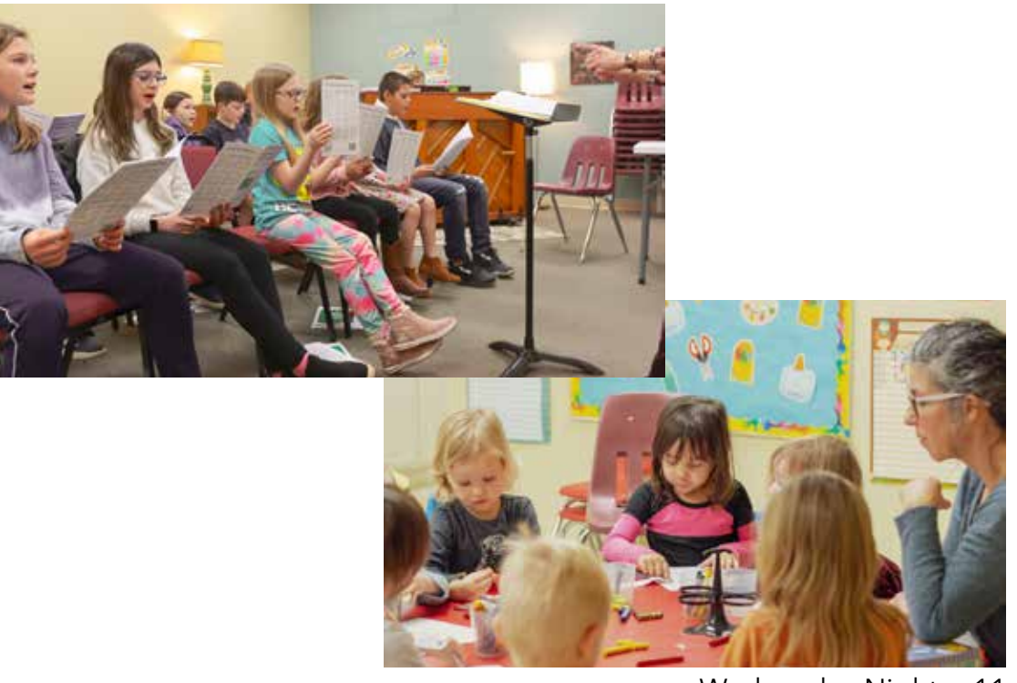
Wednesday Nights 11