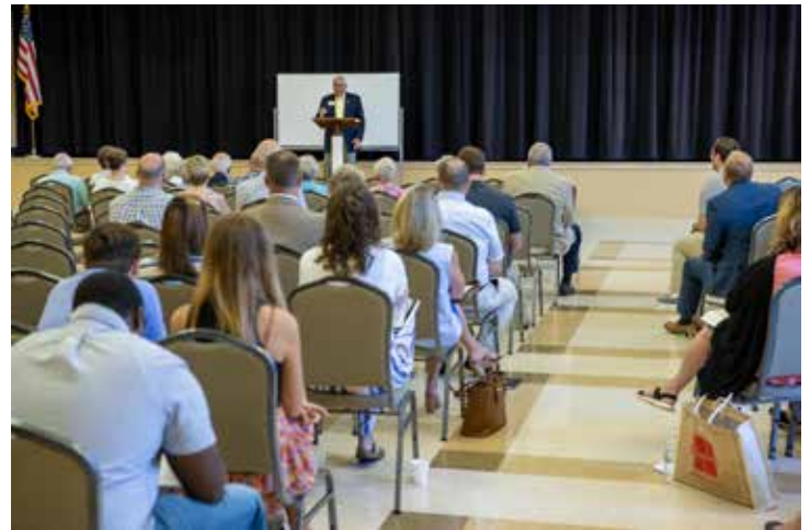
Left: Children's Sunday Morning Growth Class Right: Combined Adult Sunday Morning Growth Class.

Our website has full details on the current class offerings for adults under the Classes menu option of sapc.net .