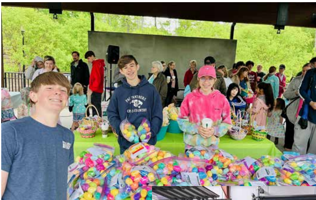
Above: Easter Egg Hunt at Irmo Community Park Right: Christmas Blitz at the Irmo Fire Department Below: Adults at the Operation Christmas Child Packing Center in Charlotte, NC Left page: Fall Festival at New Life Field