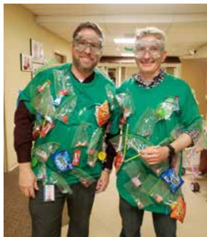
Above: Children's Ministry Volunteers