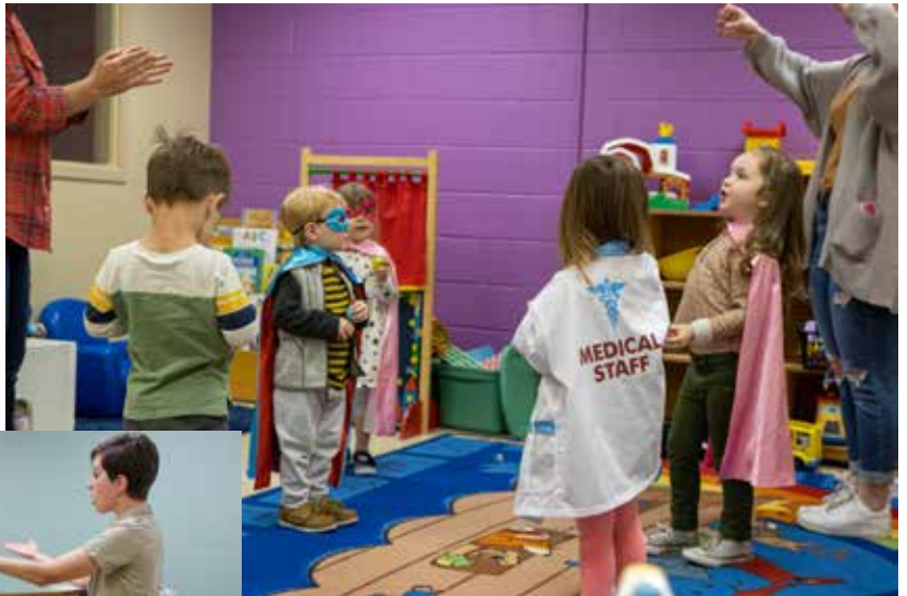
Above: PB&J children. Left: Children's Choir rehearsal Right Page: Youth Group

Students meet for Bible study and use What's Up? Curriculum. Students discover how to be a follower of Christ in real-life everyday situations.