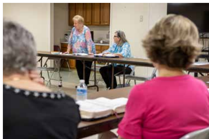
Left: College & Career Connect Group Right: Women's Tuesday Morning Study, Summer 2022