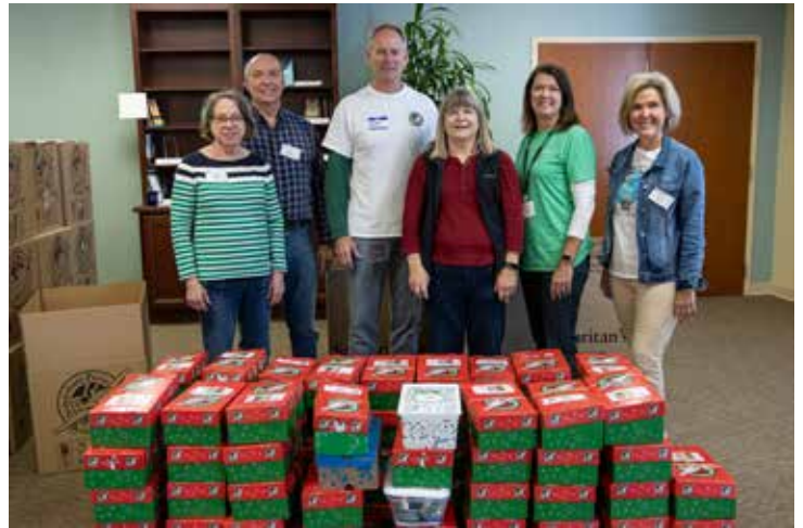
Above: OCC drop-off volunteers