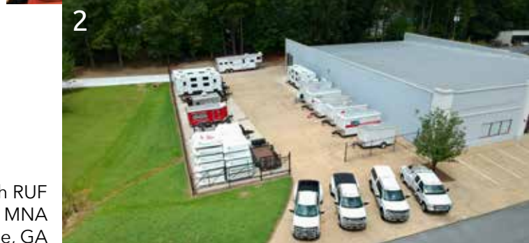
1: Scott Andes with RUF International at USC 2: MNA Disaster Relief building, Rome, GA